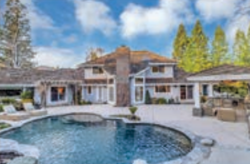
207 Rheem Blvd, Orinda 5 BD 4.5 BA 3046 SF 2 Lots $2,495,000