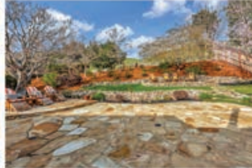
124 Derby Lane, Moraga 4 BD 4.5 BA 5057 SF 1.8 AC $4,300,000